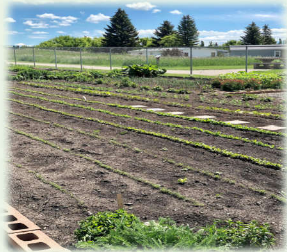
Beginning of the season