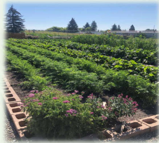
End of the season